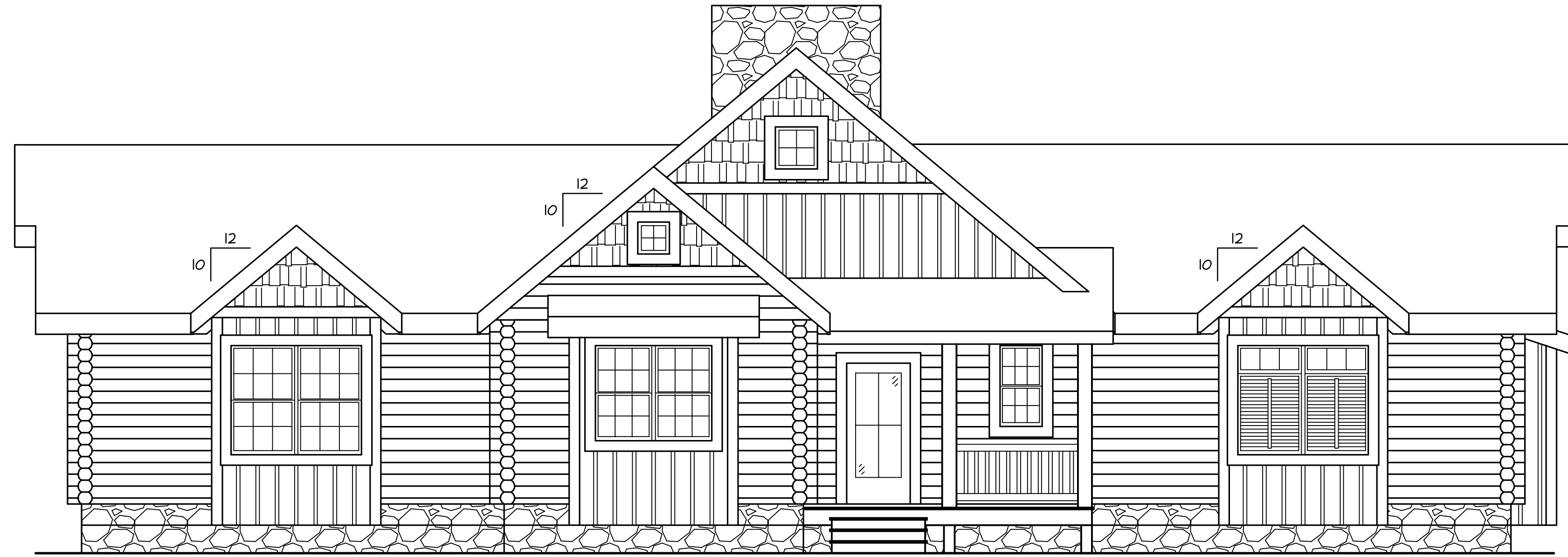
FRONT ELEVATION 1/8" = 1'-0"